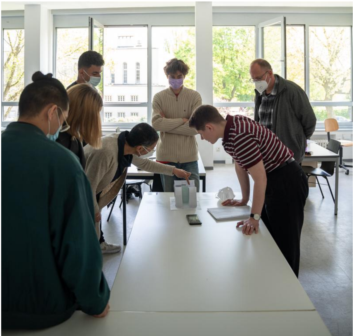
Workshop: Our Body Between Space and Object, teaching at Bielefeld University of Applied Sciences, FH Bielefeld, Faculty of Design, Germany, 2022