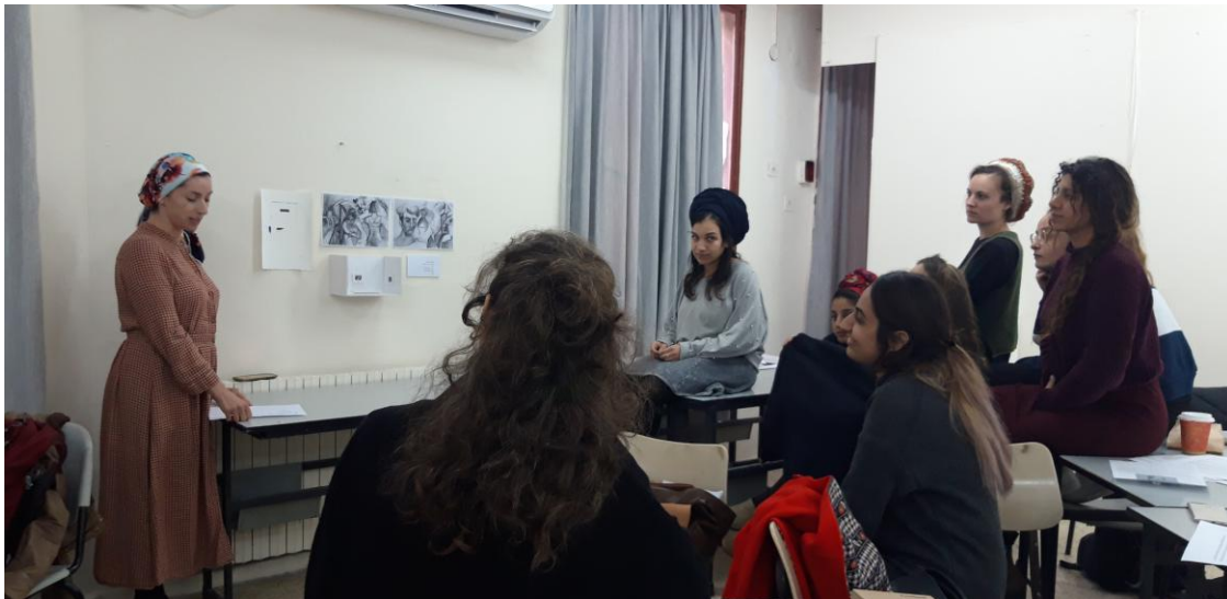
Department of Fine Arts, Emuna College, a Jewish orthodox women academy, Jerusalem, Israel, 2019

This workshop was developed for art students and it can be adjusted to different needs of art departments, following the specific study and focus points of that year.