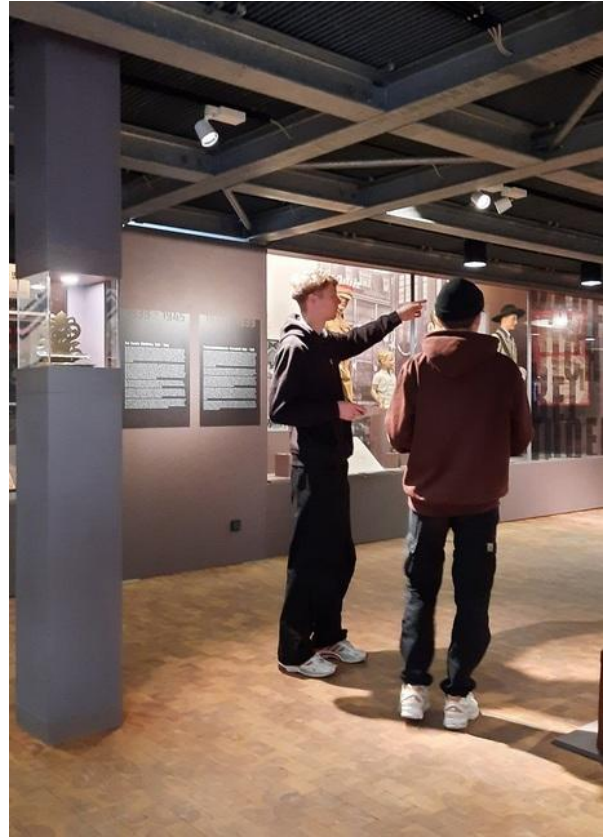
Hochschule Bielefeld, University of Applied Sciences and Arts, Germany, 2023

Second session: visiting an exhibition in a public place (museum or gallery) and analysing the relations between our body, the objects and the space, according to the learned tools.