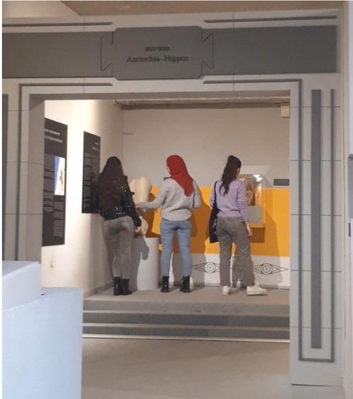
Department of Fine Arts, mix classes of Israelis and Palestinians students, Haifa University, Haifa, Israel, 2020

Third session: installing one art work of their own in a given space. This can be presented by model, drawing, Power Point or any other visual tool. Each student will give a presentation of the exercise in front of the class.