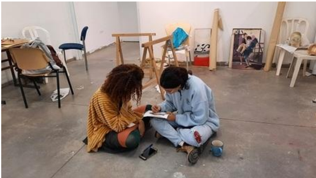
Pardes, school of visual arts, Givat Washington, Israel, 2021 – 2022

Second session: visiting an exhibition in a public place (museum or gallery) and analysing the relations between our body, the objects and the space, according to the learned tools.