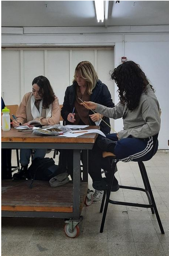
Sapir Academic College, Art Department Hanegev, Israel, 2022